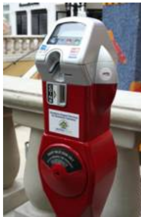
New Donation Station

On Tuesday, October 25, the Downtown San Diego Partnership (DSDP) launched Movin' Home , a new program that will allow the public to make direct donations to help end homelessness using donation stations placed throughout the city. The stations, donated by IPS Group, are converted solar-powered parking meters, and the funds raised will be used for "Move-in Kits" to help support successful transitions into housing. The Kits provide for furniture, bathroom and kitchen supplies, other household necessities, and other expenses needed to help people move into - and stay stable - in their new homes. Civic and business leaders, including Mayor Jerry Sanders, City Council President Pro-Tem Kevin Faulconer, City Councilmember Todd Gloria, and Kris Michell, President of the Downtown San Diego Partnership, made the first donations to a station yesterday at the program's public launch event. The first 3 of 25 stations have been installed around Horton Plaza, at the entrances of Broadway Circle, First Avenue, and Forth Avenue. The program's initial goal is to raise enough funds from the stations for at least one Move-In Kit by the holidays. Visit DSDP's Facebook page to view photos and read press coverage of the event.